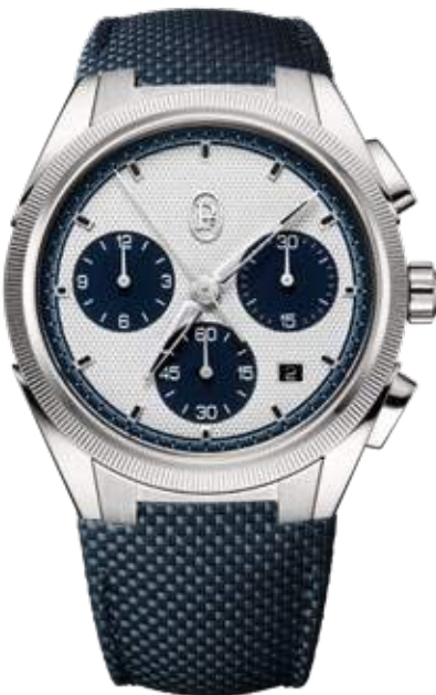
Stainless steel PFC931-1020003-400182

PF070 – COSC-CERTIFIED AUTOMATIC MANUFACTURE MOVEMENT WITH INTEGRATED CHRONOGRAPH Power reserve: 65 hours Frequency: 36,000 Vph (5 Hz) Jewels: 42 No. of components: 315 Total diameter: 30.6 mm Thickness: 6.95 mm Decoration: satin-finished open worked bridges, hand-bevelled edges Oscillating weight: 22ct rose gold, skeletonized, polished and sandblasted