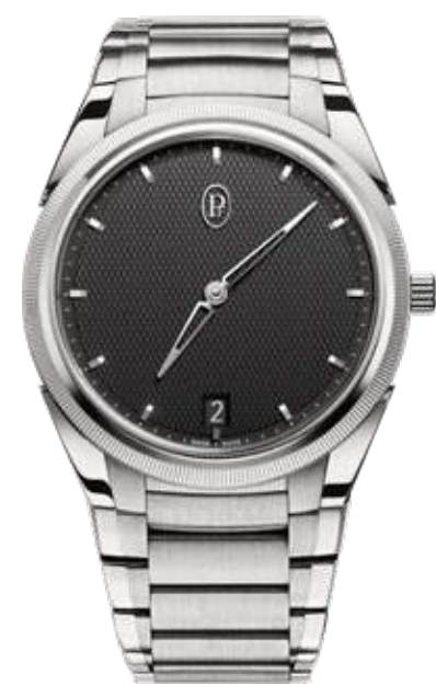
Stainless steel PFC914-1020001-100182

DIAL SPECIFICATIONS Color: Warm Grey Finishing: Grain d'Orge hand-guilloché Indexes: hand-applied 18ct gold rhodium-plated appliques BRACELET Polished and satin-finished stainless steel bracelet Closure: Stainless steel folding clasp