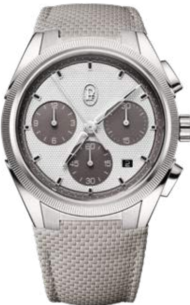
Stainless steel PFC931-1020003-400182

Artic Grey rubber strap Closure: stainless steel folding clasp