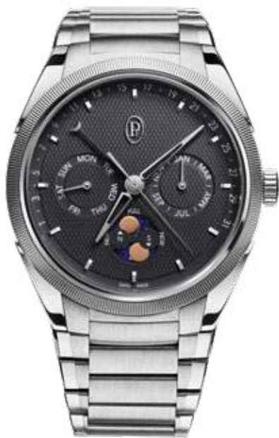
Stainless steel PFC907-1020001-100182

By pushing the date outwards onto the minute track and using discreetly outlined counters on the warm grey guilloché dial, Parmigiani Fleurier has managed to balance the pared-down equilibrium of the collection's design language with an elaborate layout.