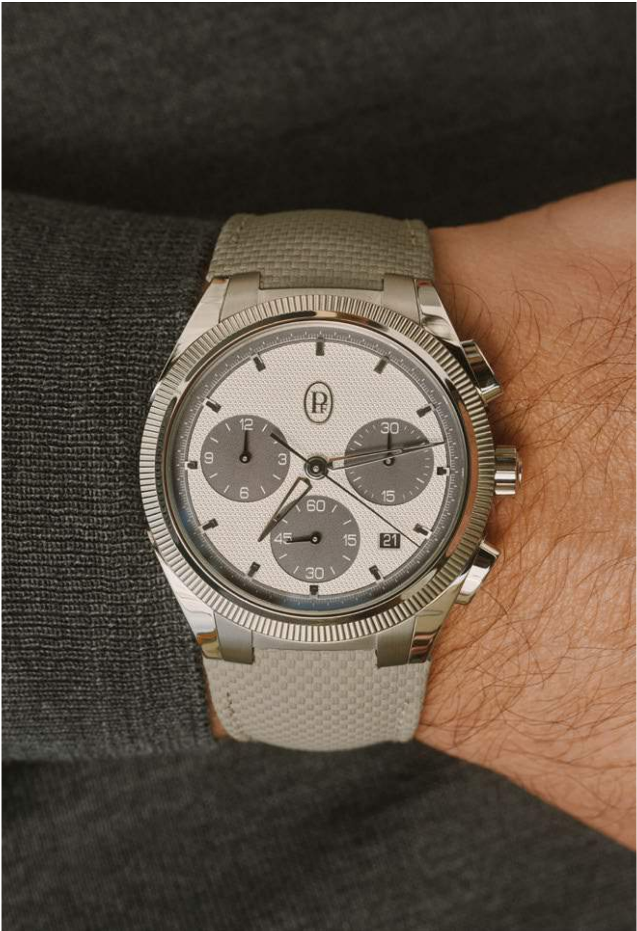
COLLECTION PARMIGIANI FLEURIER