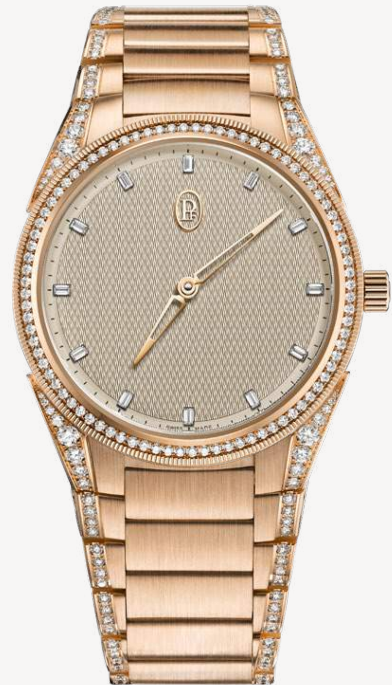
COLLECTION PARMIGIANI FLEURIER

An even more precious creation, very much in the inimitable spirit of Parmigiani Fleurier. Nothing extravagant, but finesse and pure sophistication throughout. The version with “Sand Gold” guilloché dial and baguette-cut diamond indexes displays an even richer and more delicate setting. The visual signature of this creation is the cascade of brilliant-cut diamonds on the outer sides of the bracelet. The diamonds differ in sizes to fit perfectly into their allotted spaces, which are chiselled into the gold. The bezel positively teems with brilliant-cut diamonds, as does the precious clasp buckle, at the centre of which the PF brand logo is proudly nestled, resplendent in 18-carat pink gold.