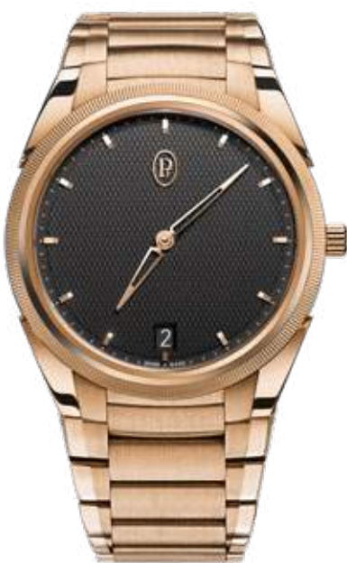
Rose gold PFC914-2020001-200182

DIAL SPECIFICATIONS Color: Warm Grey Finishing: Grain d'Orge hand-guilloché Indexes: hand-applied 18ct gold rhodium-plated appliques BRACELET Polished and satin-finished stainless steel bracelet Closure: Stainless steel folding clasp