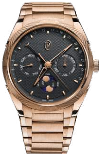
Rose gold PFC907-2020001-200182

FUNCTIONS Hours, minutes, seconds, retrograde annual calendar and precision moon phase