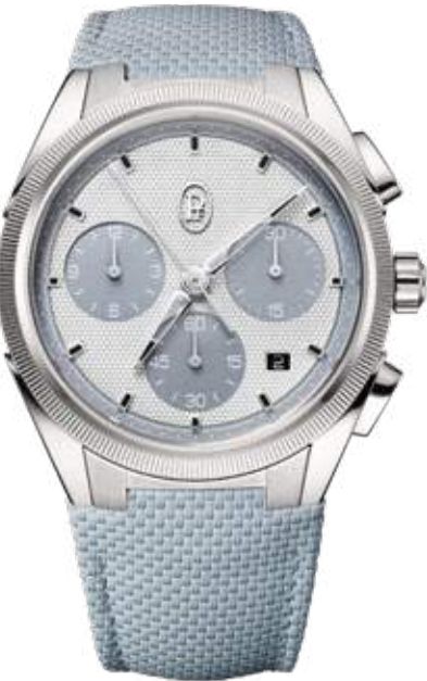
Stainless steel PFC931-1020003-400182

Hours, minutes, small seconds, date and chronograph